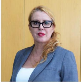
CARMEN SAN FRANCISCO